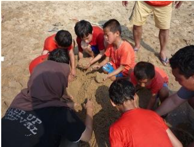
NIVI children at pattaya beach site

By Pema Gyeltshen (Literary committee In-charge).