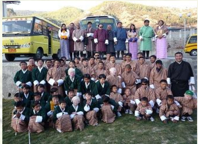
Staff and children at Thimphu before leaving to Bagkok